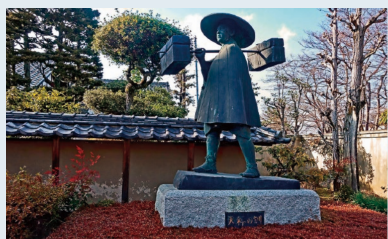
Omi Shonin depicting the famous saying, "Build a fortune with a single pole."

They were also famous for the business philosophy, "sanpo yoshi," (lit. good for three ways) meaning "good for the seller, the buyer, and for society." This famous and respected motto was widely adopted, and is a guiding principle still today for entrepreneurs and businesses.