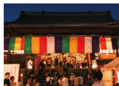
Guide post marking the Hokkoku Kaido trail (left), and the Kinomoto Jizo-in Temple a centra

a mild and deep sauce." He added that hundreds of kinds of yeast and bacteria cultures live on the beams and walls of their warehouse where the barrels are kept. "They've lived there since the foundation of our brewery. The microbes, climate, environment and the traditional methods all make up the taste and quality of our soy sauce."