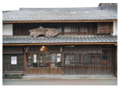
the clear spring well used for sauce (bot. left), and their charming traditional storefront (bot. right)

"We make soy sauce from scratch, starting from soy bean steaming, making koji malt, and everything to bottling by hand, all in-house. There aren't many strictly independent soy sauce producers left in Japan."