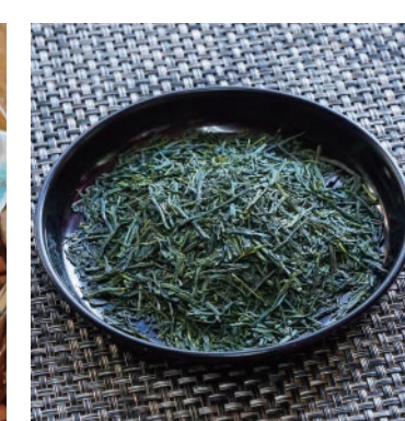
Quality green tea meets high standards for both flavor and aroma.