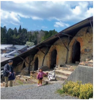
One local potter's facilities in the Shigaraki pottery district (left) and an old decommissioned