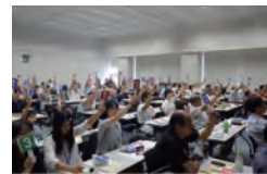
Fig. T4-1 3rd Mother Lake Forum Scene from the Biwa- comi meeting (August 31, 2013)