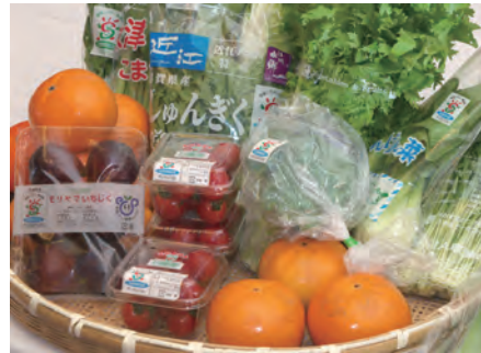
Fig. 3-12-2 Environmentally-friendly agricultural produce