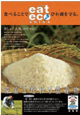
Fig. 3-12-1 Environmentally-friendly agricultural produce PR poster

(Food Brand Promotion Division, Shiga Prefectural Government)